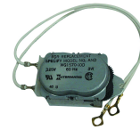
WG1570-10DMX 125 VAC, 60 Hz Motor for T101, T103, T105