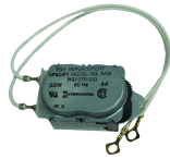
WG1570-10D 125 VAC, 60 Hz Motor for T101, T103, T105